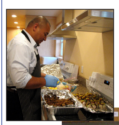
for Saturday, December 7th, 3:00 PM. We will have our first planning meeting Sunday, October 6th following

The 10th Annual Tea/Auction is scheduled