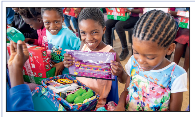
CHILDREN INVITE FRIENDS, FAMILY TO LEARN ABOUT JESUS By an Operation Christmas Child national leadership team member in a sensitive country

God is using Operation Christmas Child to open doors for more children around the world to learn about Jesus, even in what we call sensitive countries where there are serious social, ethnic, or political challenges to sharing the Gospel.